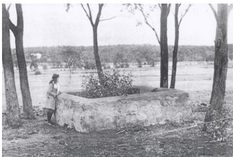
The Ninnes Grave c 1906

The reserve is a short distance along on the left.