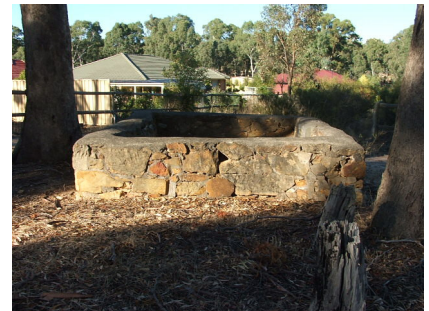
The Ninnes Grave 2006

Alternative route: From Lockwood turn right (east) towards Kangaroo Flat and join the Calder Highway (High Street) to approach Bendigo from the south via Golden Square