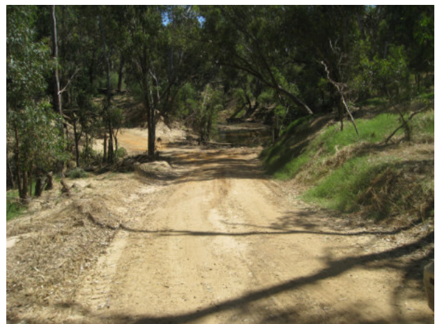
Ford on the Wimmera River near Campbell's Creek

Make sure you are well prepared. Background information and practical advice is available on the Overland Gold website - www.cornishvic.org.au/overlandgold/diy-travel.shtml