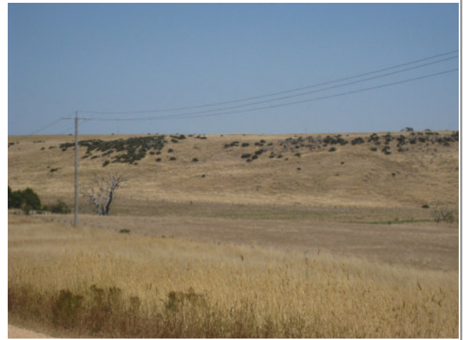
Above: Looking west along Rodborough Road, near Plaistow