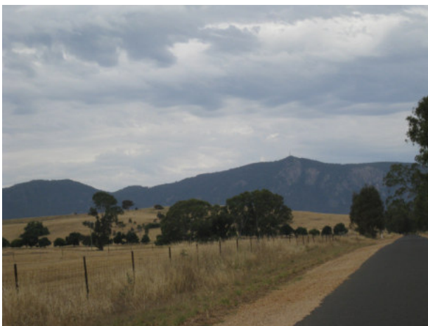
The approach to Mt Cole from the west

From Glenorchy , stay on the northern side of the Wimmera River (do not cross the bridge) and travel east to Campbell's Bridge, continuing through Green's Creek and Joel to Crowlands and join the Pyrenees Highway just to the west of Eversley. Continue on to Elmhurst and Amphitheatre