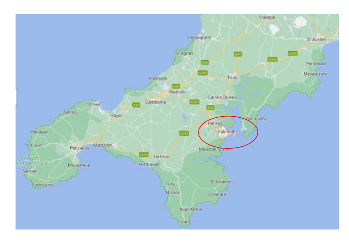
Brian's talk included lots of photos, drawings and maps. I have included some of his notes from his presentation